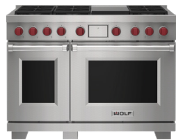
Wall oven and cooktop OR any size range*